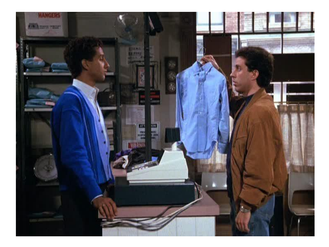
Image – X-out a dirty dry cleaners, meme image says "Where Did All Their Customers Go?" top left, bottom right "They Went to CameoCleaners, where all smart New Yorkers take their prized possessions!"