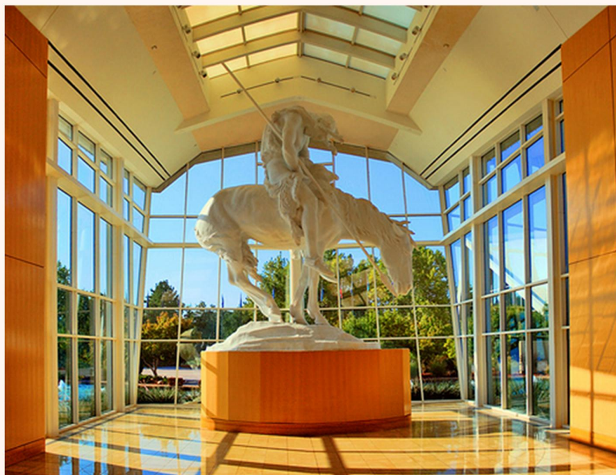
Cowboy Hall of Fame