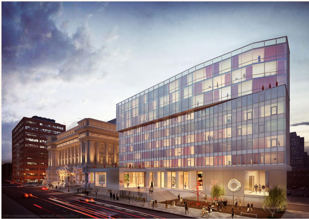
21c Museum Hotel, Indianapolis

21c Museum Hotels is redeveloping the historic Fred Jones Building. Opening in 2016, the four-story building was built by the Ford Motor Company as an assembly plant, and was designed by Henry Ford himself. The $51-million project will include 134 rooms, a restaurant and bar, and a contemporary art museum.