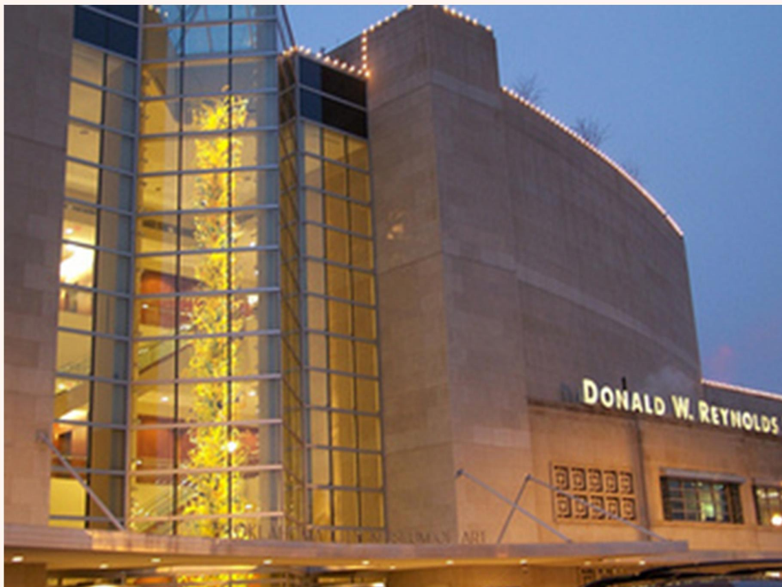
Oklahoma Museum of Art

As the nation slowly bounced back from its latest recession, many economists again marveled at the ongoing staying power demonstrated by OKC. Through the worst housing market collapse in decades, OKC maintained the country's second-lowest foreclosure rate as well as the eighth-lowest unemployment figures.